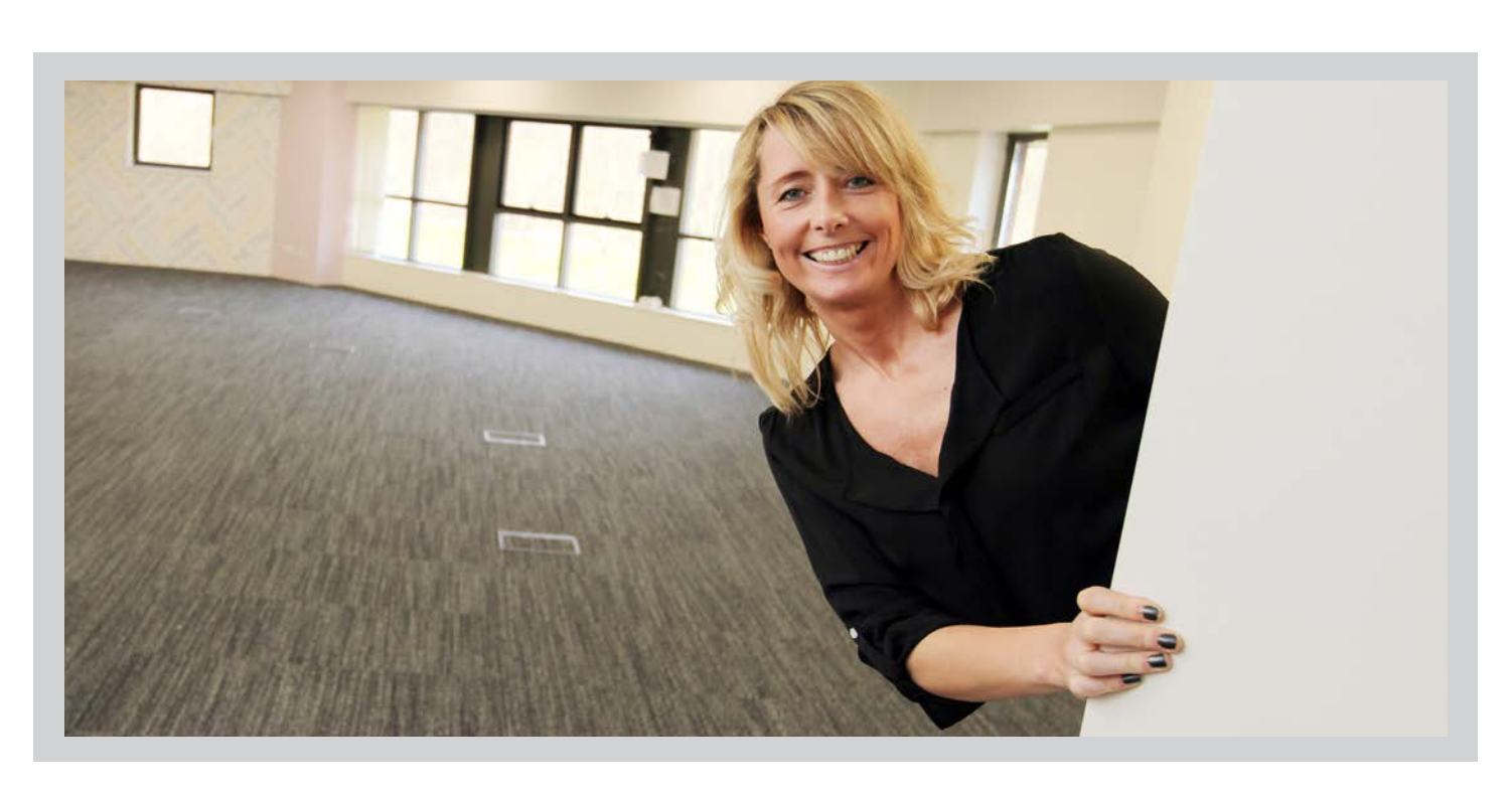
Darlington Business Central, 2 Union Square, Central Park, DL1 1GL

The £6.6m project has been supported with funding from the European Regional Development Fund (ERDF) and the Homes and Communities Agency (HCA).